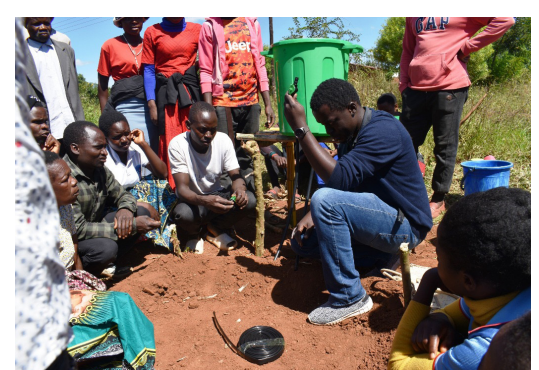
Rightsholders listening and watching attentively to Irrigation expert who was unpacking the mini-drip irrigation kit.