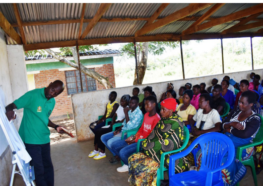
Rightsholders being trained in good Agricultural practices