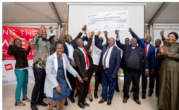
Some grant awardees celebrating