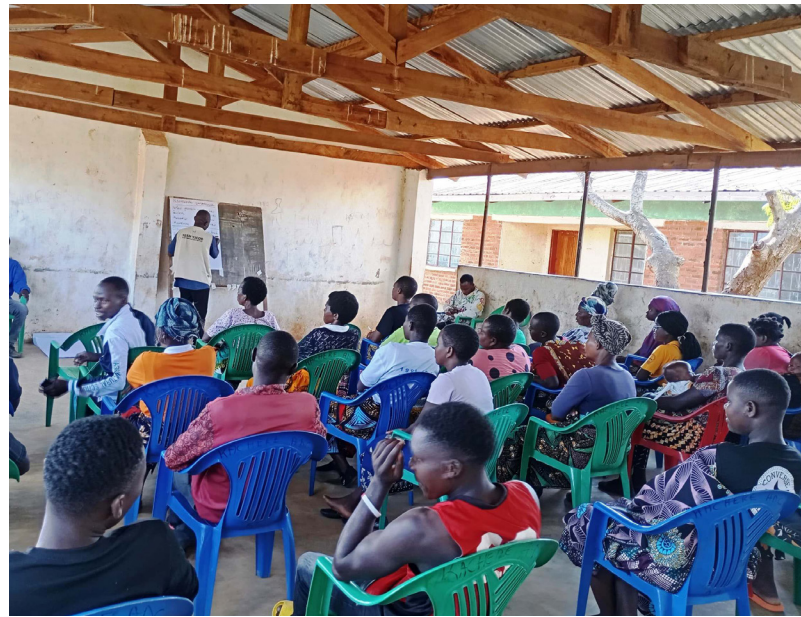
Rightsholders following proceedings of the training at Maonde Court in GVH Kachere

“Through these groups, we can gain control over our financial lives and make informed decisions about our money. Let’s be saving our money, which can enable us to invest in small businesses that will generate income, helping us in many ways, including supporting our children’s education,” she said.