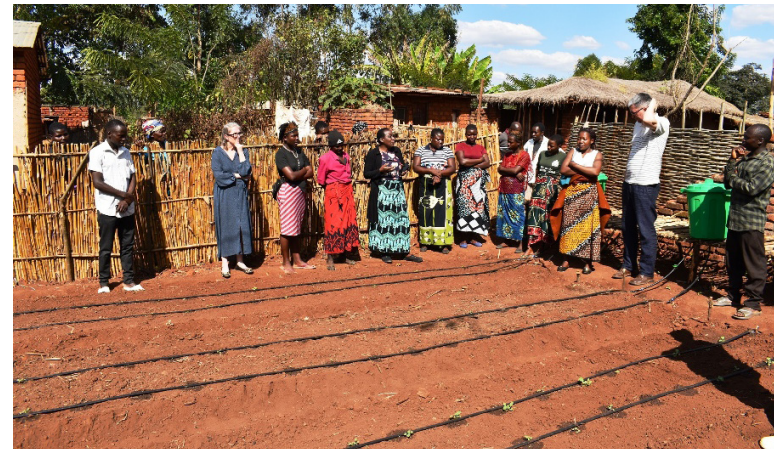
IM Swedish team interacting with Maonde Youth Club in their vegetable garden which they are using mini-drip irrigation

"Let's work hard on initiatives that aim to uplift our livelihood as we build resilience toward climate change.