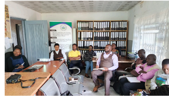
Tilitonse Foundation and Nguzu Africa during their visit at YICOD Office in Dedza