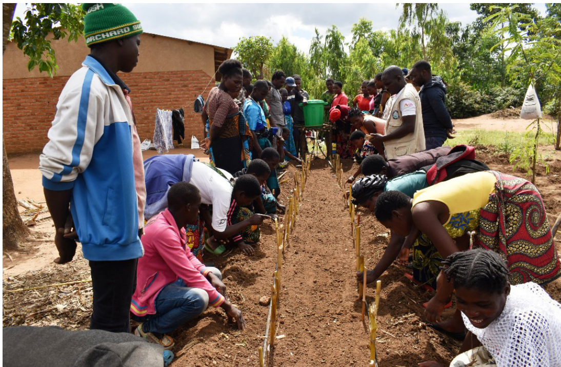
Rightsholders practising how to use the mini-drip irrigation kits

R ightsholders from the three Group Village Heads (GVH) of Fosa, Kachere, and Mkhomawathu 2 in the area of Senior Chief Kachere, Dedza district, have been equipped with knowledge and skills in mini-drip irrigation, maintenance, and plot layout, all conducted in their respective communities.