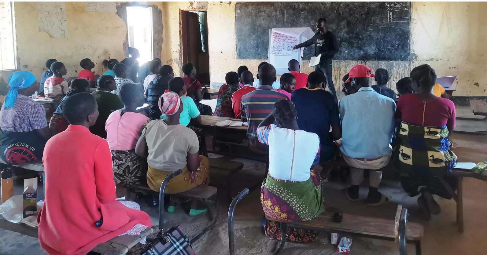
Rightsholders following proceedings of the training at Mtengo wolembera in GVH Mkhoma Wanthu 2

Rightsholders from traditional authority Kachere have been trained on how to effectively manage their Savings and Loans Groups (SLGs), including group dynamics through core support from IM Swedish Development Partner.