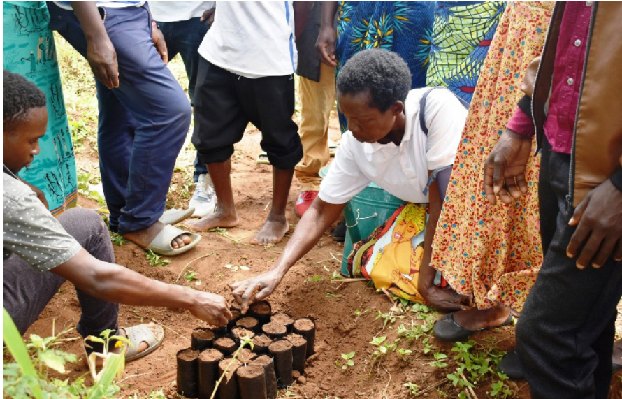
Rightsholders sowing tree seeds in tubes

The impacts of cyclones and strong winds can be lessened if we plant more trees. As young people, we will ensure that we establish woodlots, as trees also provide us with economic benefits when we harvest and sell timber and firewood,” said the 32-year-old.