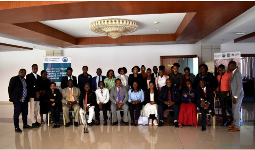
Youth leaders in a group photo with Chairpersons of Parliamentary Committees and MDAs after the engagement in the Parliament building