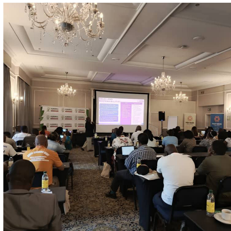
Partners following the proceedings of the convening

Youth Initiative for Community Development (YICOD) attended the Hlanganisa Community Fund 2025 annual partners convening in South Africa convened by Hlanganisa Community Fund for Social and Gender justice.