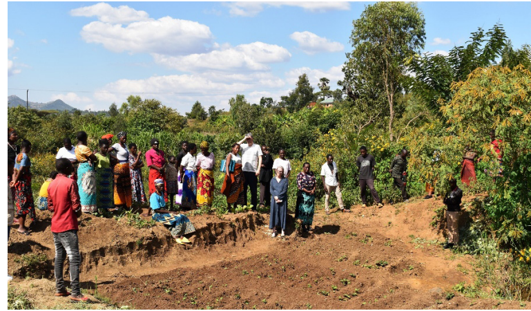
IM Swedish team interacting with Maonde Youth Club in their Orange Fleshed Sweet Potatoes multiplication field

Before interacting with the rights holders, the IM Swedish Development Partner team engaged with YICOD staff to share knowledge and best practices in programming to improve the livelihoods of rights holders.