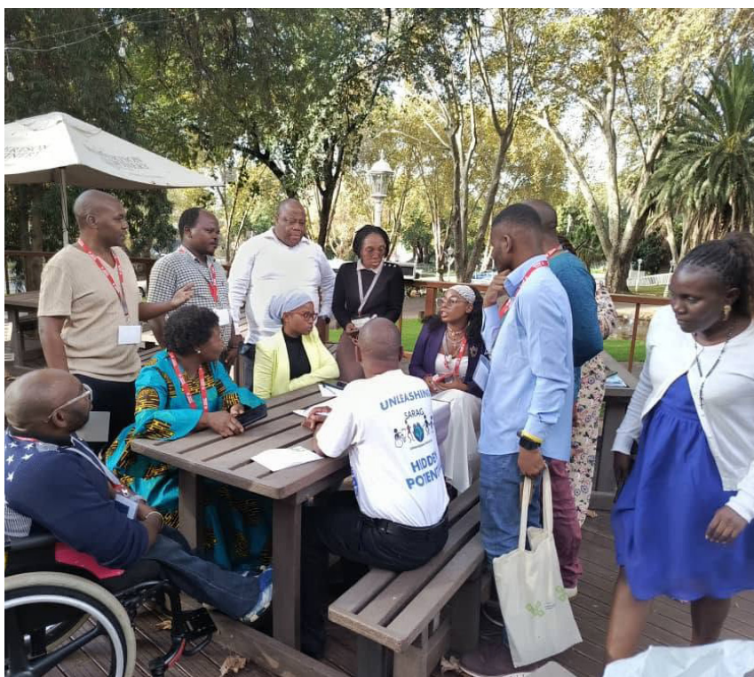
Representatives of the partners brainstorming ideas during the group discussions