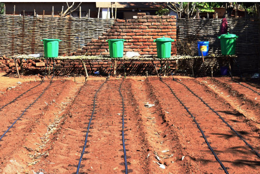
A vegetable garden for Maonde Youth Club which they are using the mini-drip irrigation