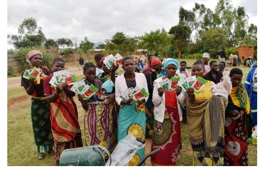
Rightsholders from GVH Fosa showing off their vegetable seeds which they received