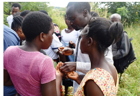
Young people preparing the seeds before sowing them

“We need to restore the forest reserves that we had here by planting more trees so that we can receive sufficient rains in a timely manner,” she said.