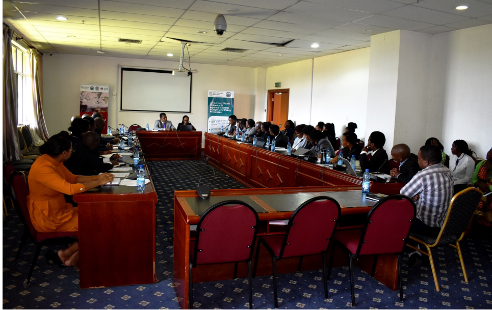
The meeting in progress at the Parliament building

Young people drawn from various districts in the country meaningfully engaged with chairpersons of various committees of the National Assembly and representatives of various Ministries, Departments, and Agencies (MDAs) with the shared mission of increasing accessibility and funding to Sexual Reproductive Health Rights (SRHR) and services.